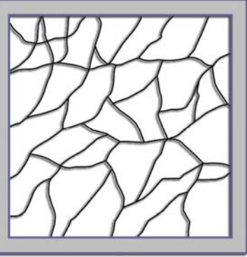
Figure 3. Dicing