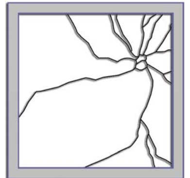
Figure 1. Traditional Impact Load